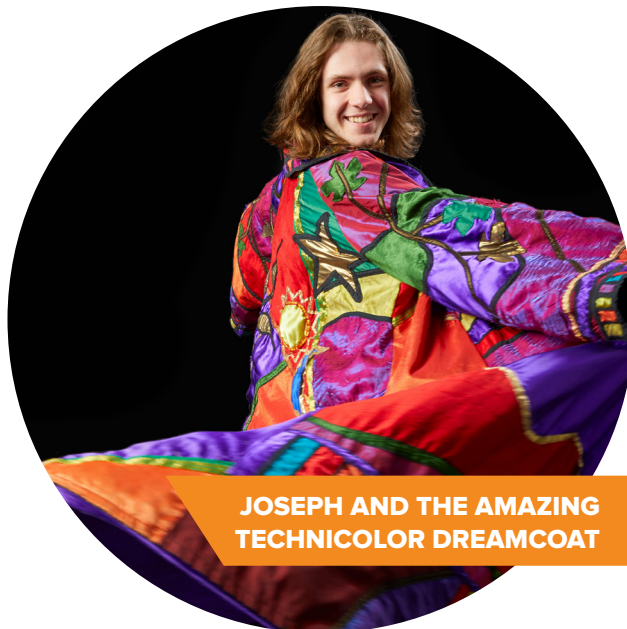
JOSEPH AND THE AMAZING TECHNICOLOR DREAMCOAT

28th-29th: St Bartholomew's Church Book Fair Fri 9am-6pm, Sat 9am-2pm, 23 Cass St, Kaiapoi. A two-day book fair offering a great selection of books, puzzles, DVD's and more! This is a fundraiser towards the maintenance of St Bartholomew's Church and Hall.